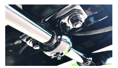
Greasable latch bearings